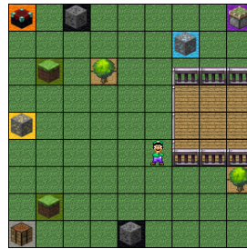
Figure 1: Minecraft-inspired domain containing natural resources, buildings where they can be processed, and perils such as zombies (adapted from [Andreas et al. , 2017]).

Tabular q-learning [Watkins and Dayan, 1992] learns policies by learning to approximate the optimal q-function. An approximate q-function \tilde{q}(s, a) is initialized in some manner